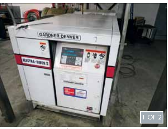
Gardner Denver Electra Saver II Air Compressor