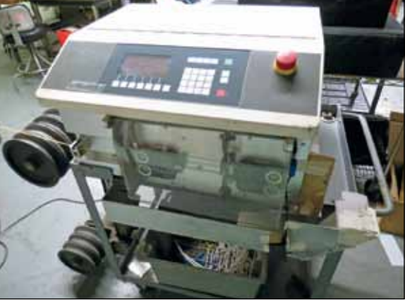
Schleuniger Powerstrip 9500