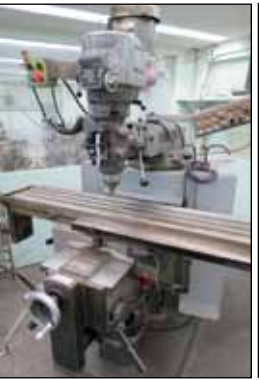
Bridgeport Vertical Milling Machine