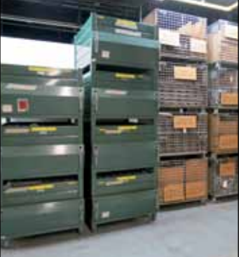
Numerous Heavy Duty Storage & Parts Bins