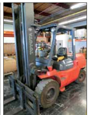
Toyota Forklift, 10,000 lb Cap.