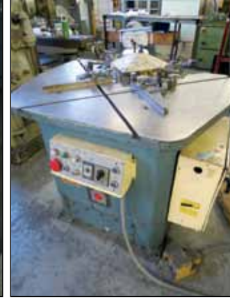
Amada Notcher CSW-220