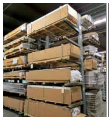
Heavy Duty Cantilever Rack Systems