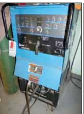
Miller Syncrowave 250DX Welder