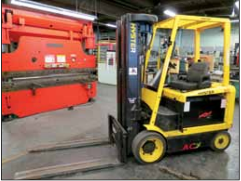
Hyster Forklift, 6,000 lb Cap.

Over (1500) Lots! Detailed Lot Catalog will be posted online on or before September 8th.