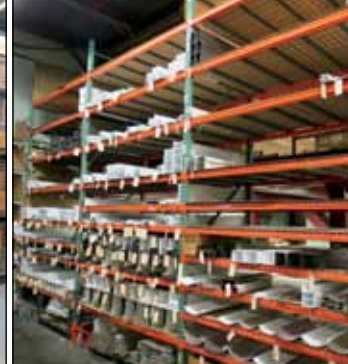
Industrial Pallet Racking