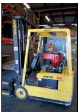
Hyster Electric Forklift