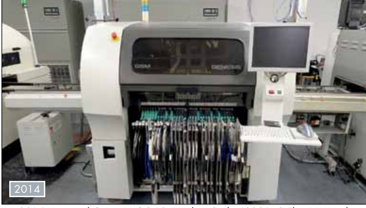
2014 Universal Genesis, GC-60, Product Code 4990A, 2 Flex Jet Heads