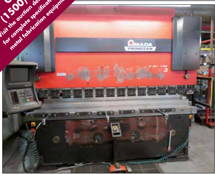
Amada HFB220-3, 242 Ton, 4 Axis CNC