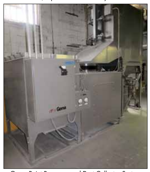
Gema Paint Recovery and Dust Collector System