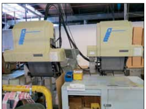
(2) Speedypacker Foam Packaging Machines