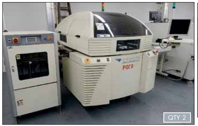
MPM Speedline UltraFlex 3000 Stencil Screen Printer