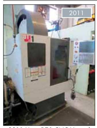
2011 Haas DT-1 CNC Vertical Milling Machine