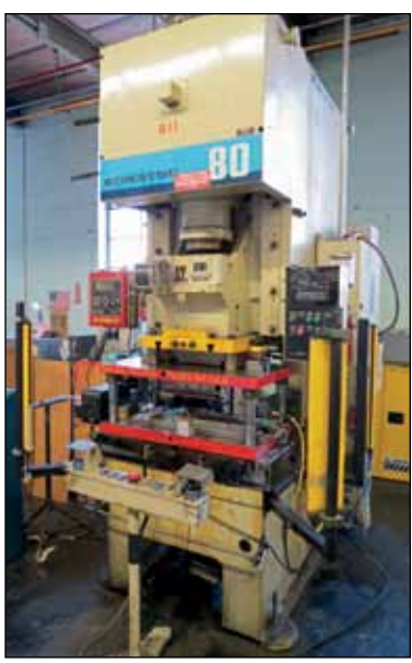
Comatsu OBS-80-VS-3 Gap Frame, 88 Ton, 37 – 75 SPM