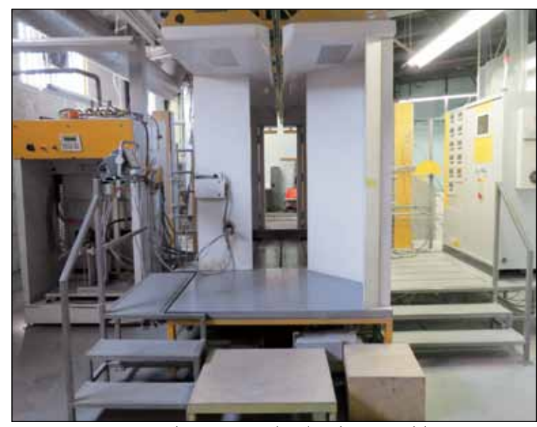
2008 ITW Gema Magic Compact BA02 10 Gun Powder Coat Paint System & GEMA PZ Powder Center Quick Color Change Module