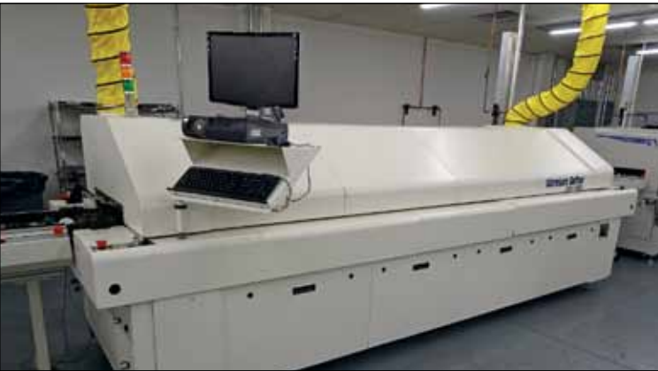
2008 Vitronics Soltec XPM 820A Oven