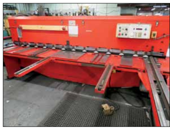
Amada M-3045, 3/16" x 120"