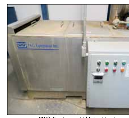
PKG Equipment Water Heater