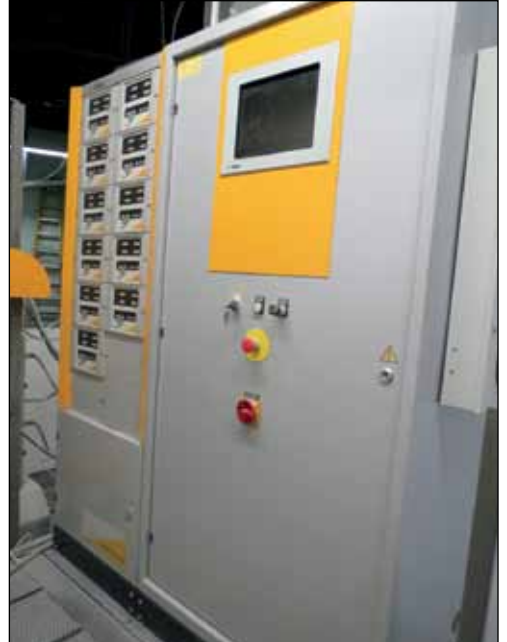
ITW Gema OptiStar CG06 Automatic Gun Control Unit, Optiflex A2 Control System