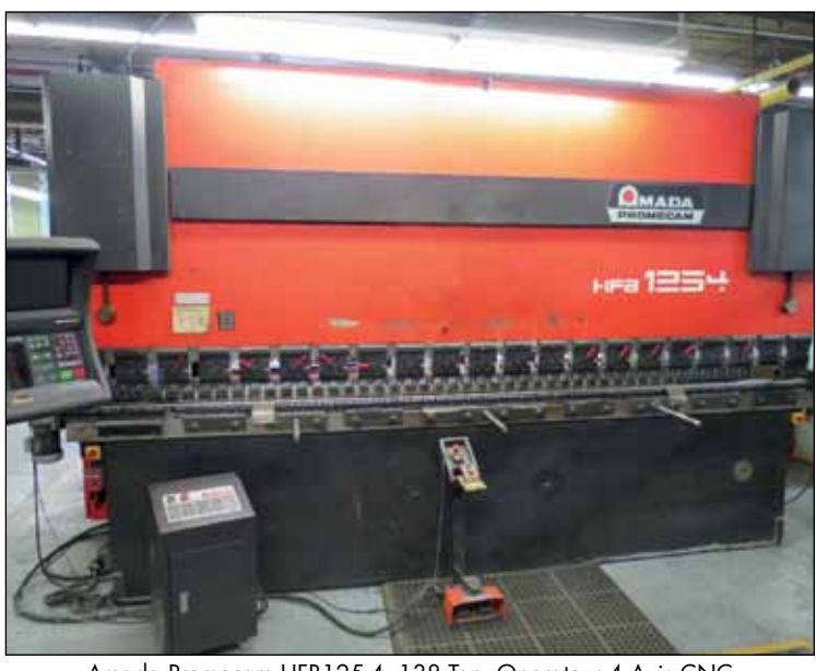
Amada Promecam HFB125-4, 138 Ton, Operateur 4 Axis CNC