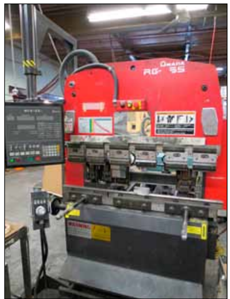
Amada RG-35s, 38 Ton, NC9-EX-II 3-Axis CNC Komatsu OBS-80-VS-3 Gap Frame, 88