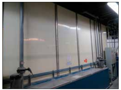
Partial view of GAT Poly Enclosure 3 Stage Wash System