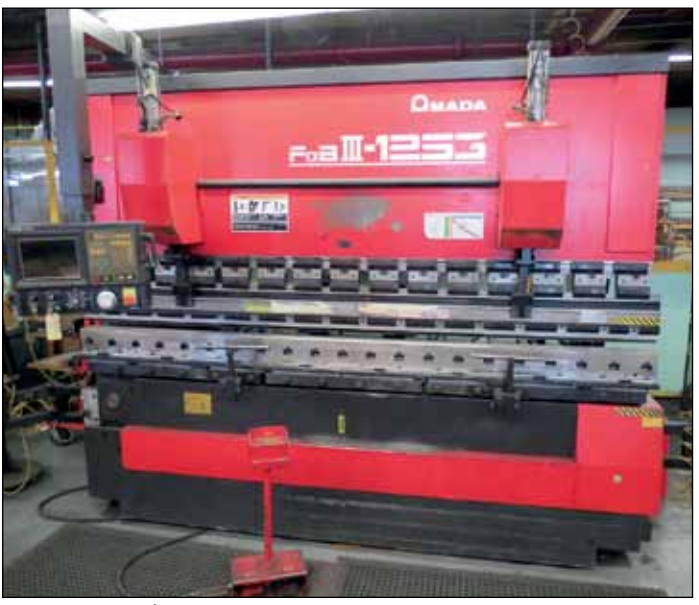
Amada FcxB III-1253, 138-Ton, NC9-FS 7 Axis CNC