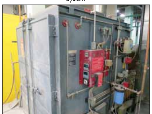
Controlled Pyrolysis Bake-Off Cleaning Furnace, Mdl. PRC 141 4140, 475,000 BTU