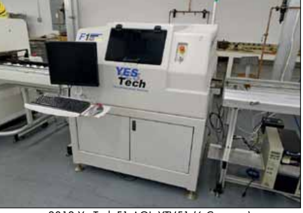
2012 YesTech F1 AOI, YTV-F1 (6 Cameras)