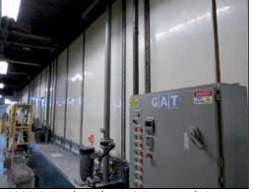
2008 GAT Poly Enclosure 3 Stage Wash System, 85' long x 5'8" wide x 12'5" high