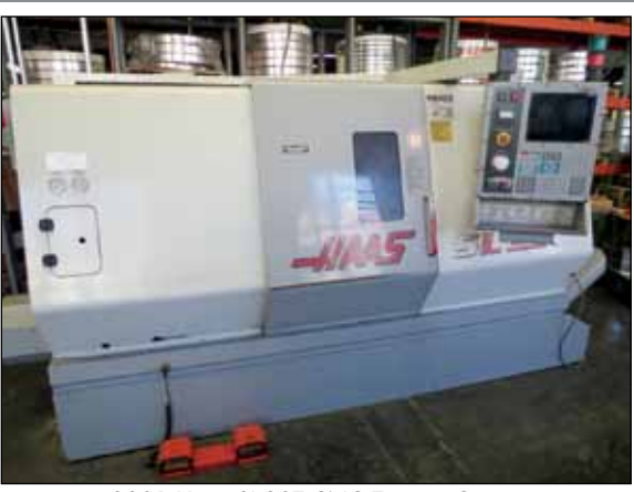
2001 Haas SL-30T CNC Turning Center