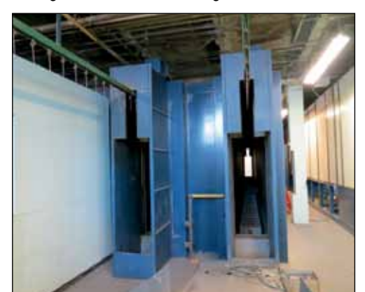
Partial view of GAT Dry Off and Cure Oven System