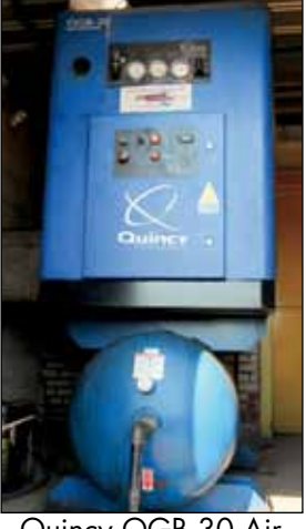
Quincy QGB 30 Air Compressor