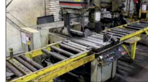
Marvel Vertical Band Saw Model 81/II, 18" x 20" Capacity