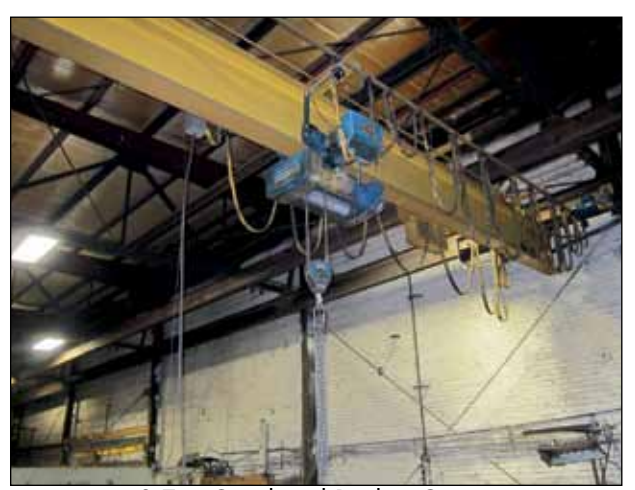
3 Ton Overhead Bridge Crane