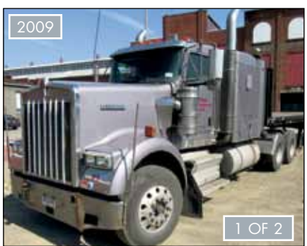
Kenworth Model W900 Sleeper Cab, 42