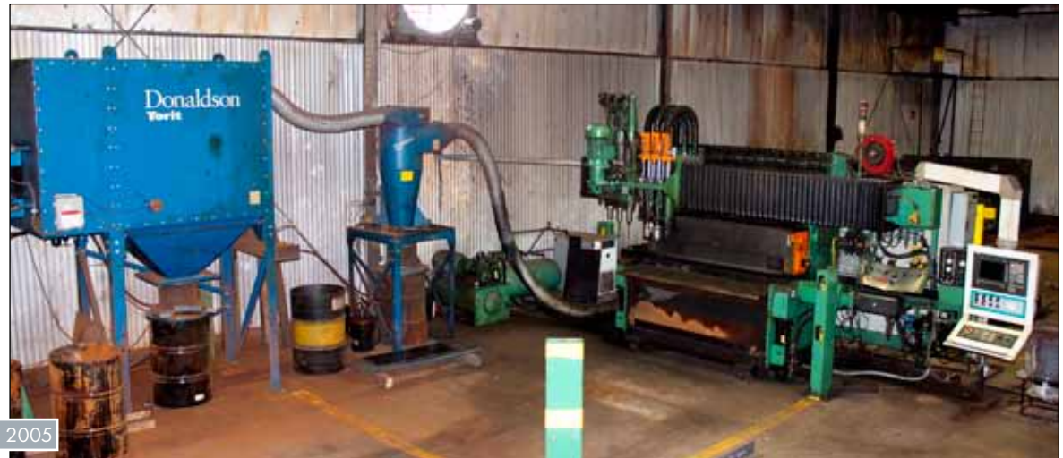
Peddinghaus CNC Plate - Drill – Plasma - Oxy Fuel Processing Machine, Model FDB 1500-C Spindle