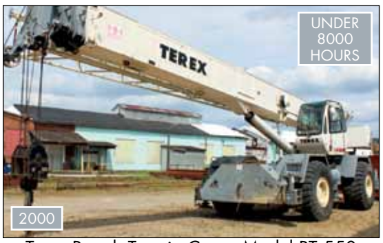
Terex Rough Terrain Crane Model RT 550