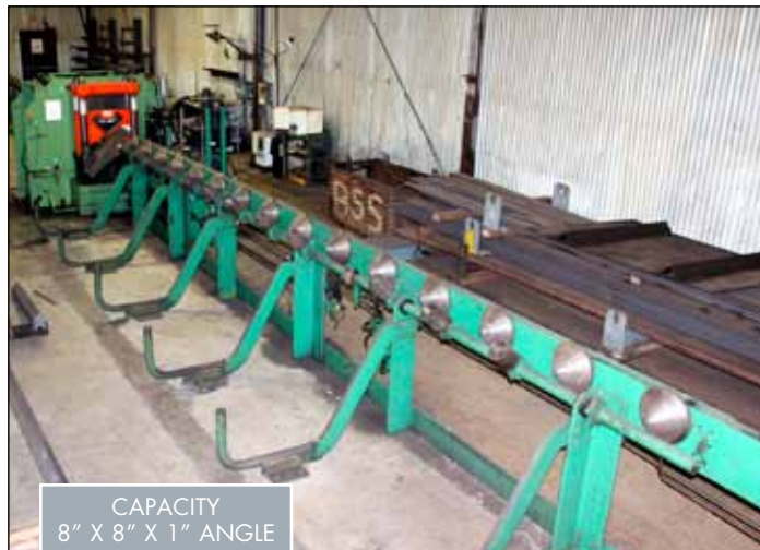
Peddinghaus Anglemaster Model AFCPS-833 (Revolution)