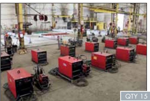
QTY 15 TO 2005 Lincoln Idealarc DC600 Welders