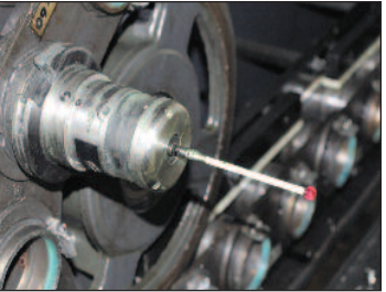
• TOSHIBA BP150.R22 CNC TABLE TYPE HORIZONTAL BORING MILL, (NEW 2009), 5.9" Spindle, X.160", Y-100", Z-28", W-60", 71" x 86" B-Axis Rotary Table, 360,000 Positions, 44,000 Lbs. Table Cap., 5-2500 RPM, 60 ATC, Tosnuc 888 CNC, Thru Spindle Coolant, Chip Conveyor, 50 HP, 2009, S/N 130385

TOSHIBA BP150.R22 CNC TABLE TYPE HORIZONTAL BORING MILL