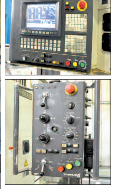
• TOSHIBA BP130.R22 CNC TABLE TYPE HORIZONTAL BORING MILL, 5.12" Spindle, X-137",Y-90", Z-27.5", W-63", 70.8" x 86.6" B-Axis Rotary Table, 360,000 Positions, 44,000 Lbs. Table Cap., 5-2500 RPM, Tosnuc 888 CNC, Thru Spindle Coolant, Chip Conveyor, 40 HP, 1999, S/N 130308