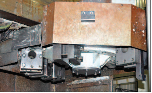
66" OLYMPIA V60 CNC VERTICAL BORING MILL, 66" Table Dia., 70" Max. Swing, 62" Max Height Under Rail, 33,000 Lbs. Table Cap., 1-350 RPM, 12 ATC, 4-Jaw Chuck, Fanuc 21i-M CNC Control, 75 HP, 1999, S/N OE-99-329