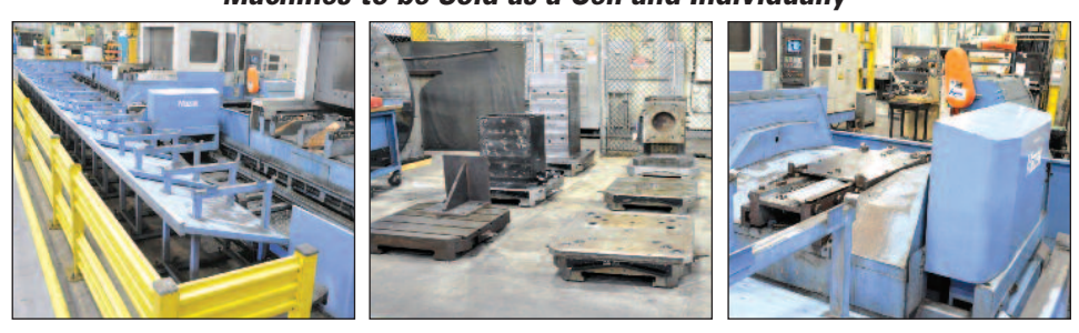
Machines to be Sold as a Cell and Individually