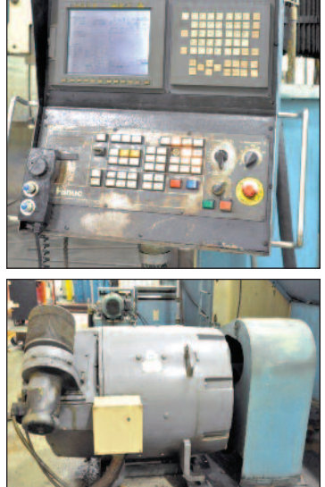
144" GRAY CNC VERTICAL BORING MILL, 144" Table Dia., 152" Max Swing, 120" Max Height Under Rail, (2) Rams, Ram Swivel 45 Degrees, Table Speeds 0.6-54 RPM, Fanuc 0-T CNC Control, Retrofit 2002, 125 HP Table Motor, S/N 9510