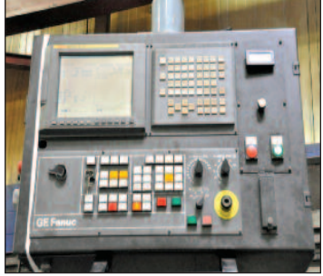
63"X 157" DAINICHI H/NC 160X400 CNC HEAVY DUTY LATHE, 63" Swing, 157.5" Between Centers, 48" 4-Jaw Chuck, 44,000 Lbs. Capacity Between Centers, 500 RPM, 4.09" Spindle Bore, Fanuc 21i-T CNC Control, Tailstock, Steady Rest, Retrofit 2008 by Machine Tool Solutions Unlimited, 73 HP, S/N 18752

63"X 177" HEYLINGSTAEDT NDKB-1000/III CNC HEAVY DUTY LATHE