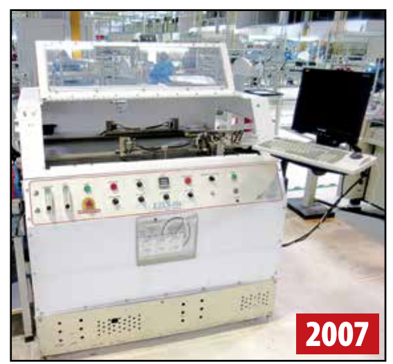
ACE PRODUCTION K.I.S.S. 104 SELECTIVE SOLDER UNIT

Av Manuel Talamas Camandari #2451, Parque Industrial Verde Independencia II, Cd., Juarez, Chih, 32580 Mexico The inspection for assets located in all days of this sale will be held on Tuesday, April 26th from 9:00 AM to 4:30 PM MDT