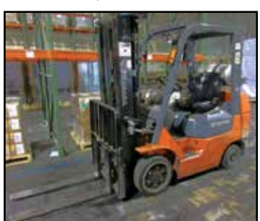
TOYOTA 4.800-LB. FORKLIFT