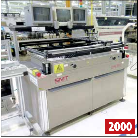
SMT 2444BAM SOLDER PASTE PRINTER