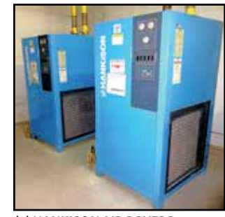
(2) HANKISON AIR DRYERS