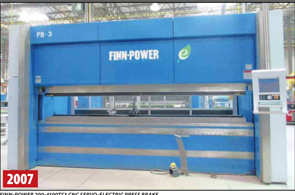
FINN-POWER 200-4100TS3 CNC SERVO-ELECTRIC PRESS BRAKE