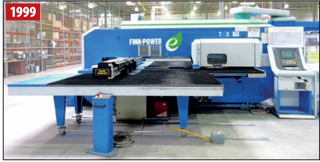
FINN-POWER E5 SBU ELECTRO-SERVO TURRET PRESS