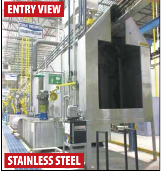
THERMO-TRON-X 8-STAGE PRE-TREATMENT WASHER