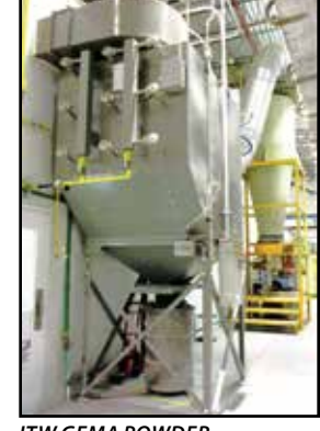
ITW GEMA POWDER RECLAIM SYSTEM