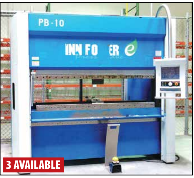
2007 FINN-POWER 50-2050TS1 CNC SERVO-ELECTRIC PRESS BRAKE