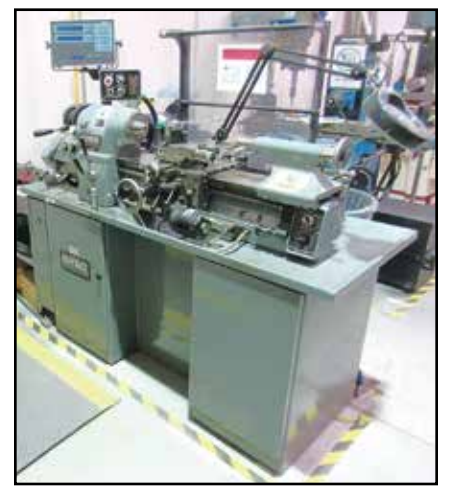
HARDINGE PRECISION LATHE

ALSO: HARDNESS TESTERS, HEIGHT GAUGES, MICROMETERS, VERNI-ERS, THREAD AND DEPTH GAUGES, GRAN-ITE SURFACE PLATES, KURT VISES, SINE PLATES, MAGNETIC CHUCKS, DBL END GRINDERS, CARBIDE GRINDERS, DISC/ BELT SANDERS, MAG BASE DRILLS, PER-ISHABLE TOOLING INCLUDING DRILLS, REAMERS, CUTTERS, CARBIDE INSERTS, TAPS, V FLANGE TOOLS HOLDERS, BORING BARS, HAND AND POWER TOOLS, ETC.