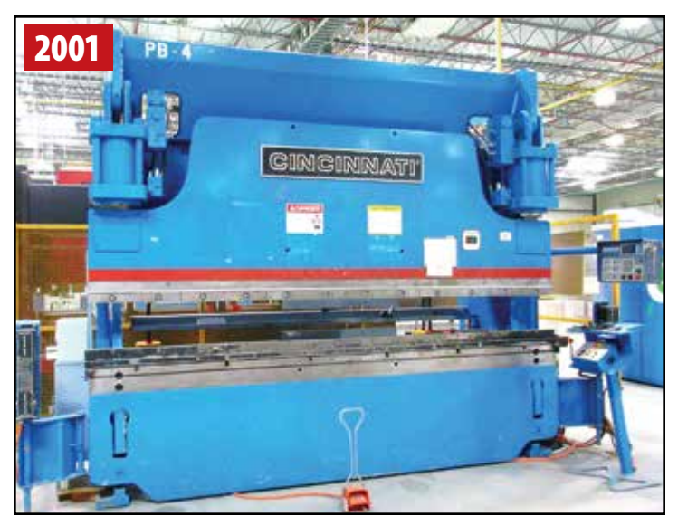
CINCINNATI 230CBII X 10 CNC HYDRAULIC PRESS BRAKE