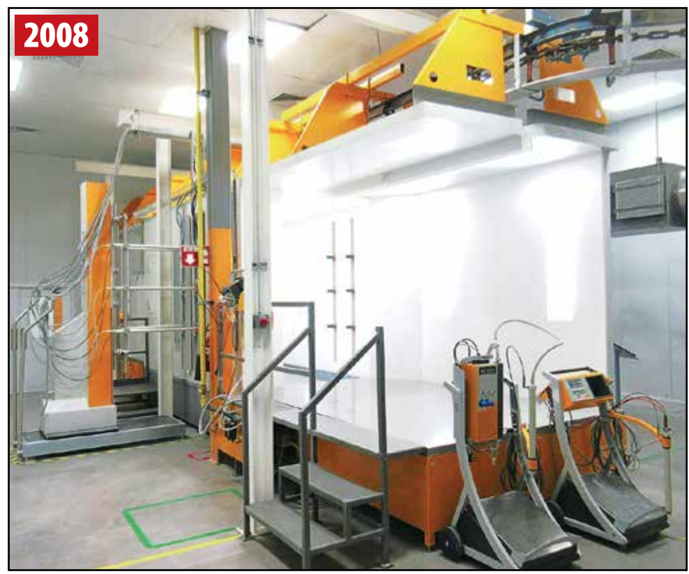
ITW GEMA POWDER COAT PAINT SYSTEM