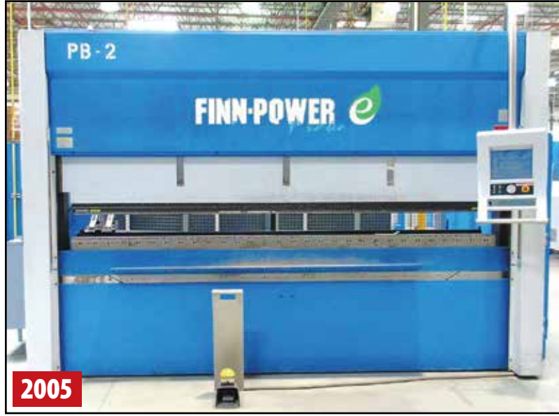
FINN-POWER 100-3100TS1 CNC SERVO-ELECTRIC PRESS BRAKE