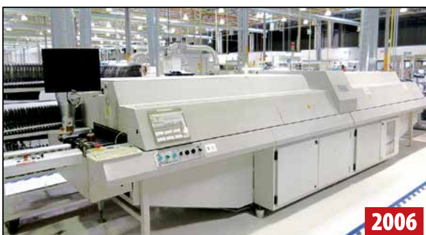
CONCEPTRONIC HVN 155 REFLOW OVEN