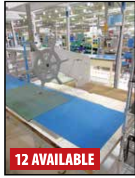
GREENERD NO 3B DEEP THROAT ARBOR PRESSES

2000 SURFACE MOUNT TECHNIQUES 2444BAM SOLDER PASTE PRINTER, s/n 1872