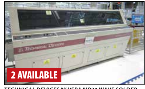
TECHNICAL DEVICES NU/EPA MP24 WAVE SOLDER MACHINES