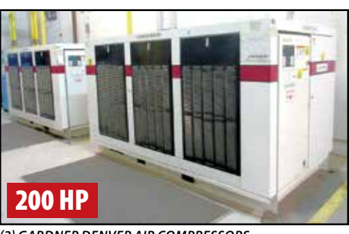
(2) GARDNER DENVER AIR COMPRESSORS