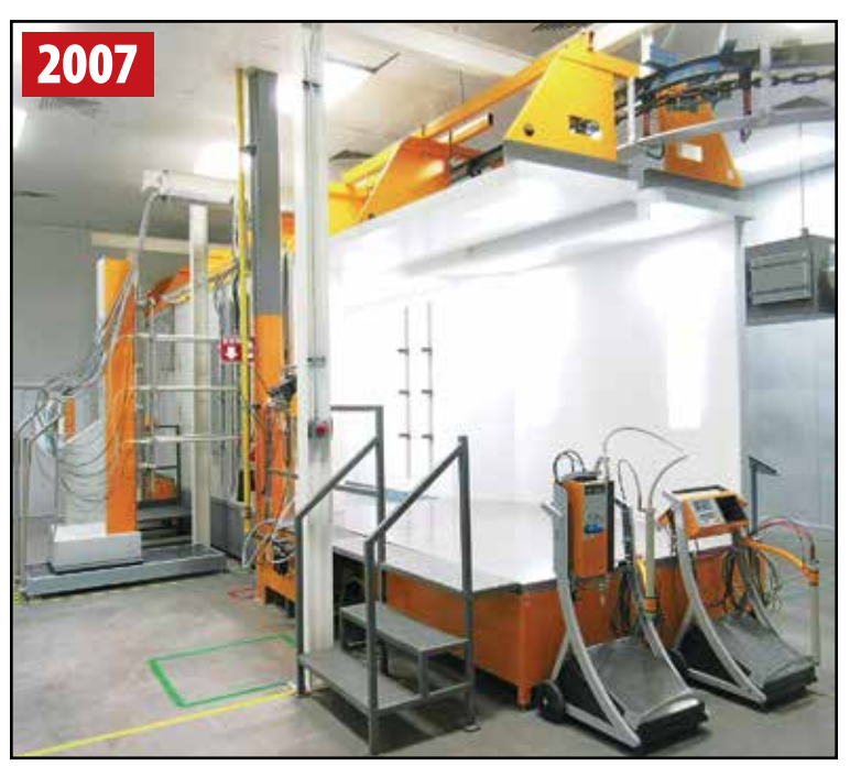
ITW GEMA MAGIC COMPACT BA02 EXTENDED QUICK CHANGE BOOTH

NOTE: ALL ITW GEMA EQUIPMENT WAS PURCHASED NEW IN 2007/2008 AND INSTALLED NEW 2012