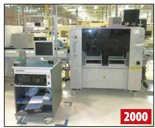
PHILIPS TOPAZ-XI PICK N PLACE MACHINE