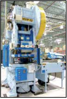
MINSTER G1-110 OBG PRESS