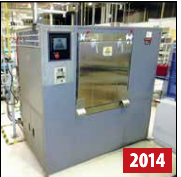
SMARTSONIC 529 STENCIL WASHER

LANDREX OPTIMA 7300 AUTOMATIC OPTICAL INSPECTOR, s/n na QUAD AVX 500 SOLDER PASTE PRINTER, s/n 500551