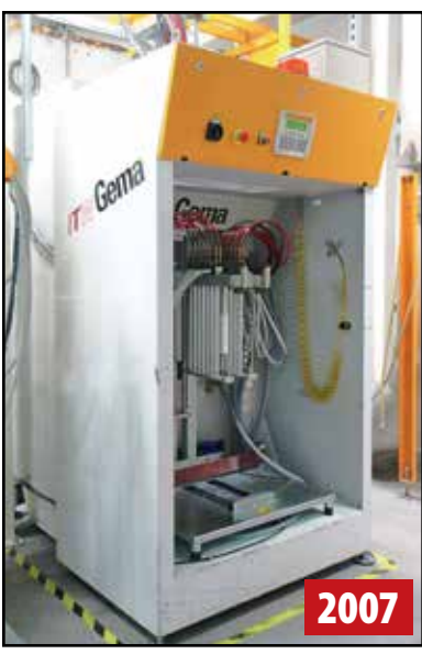
PZ POWDER CENTER W/GEMATIC CONTROL

To discuss your requirements for an auction, please call Perfection Industrial 847-545-6374