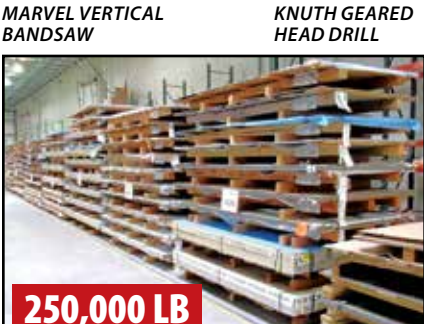
VIEW OF SHEET STOCK