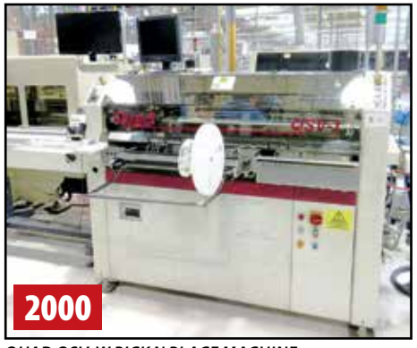
QUAD QSV-W PICK N PLACE MACHINE

Duties paid for return shipment to the US and/or prepay customs duties and fees for permanent importation into Mexico for non-Maquiladora local buyers. Door-to-Door shipment services offered for US buyers.