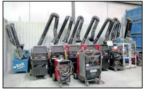
VIEW OF WELDERS AND FUME EXTRACTORS

EX-CELL-O XLO 827 OPTICAL COM-PARATOR, s/n 8270048