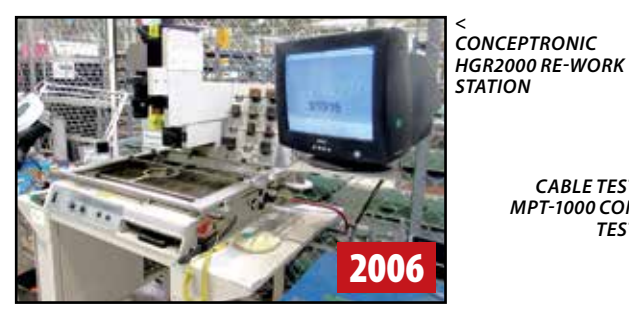
CABLE TEST SYSTEM MPT-1000 CONTINUITY TEST SYSTEM