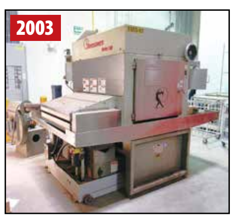
TIMESAVERS 137-2HCMW WET TYPE BELT GRINDER