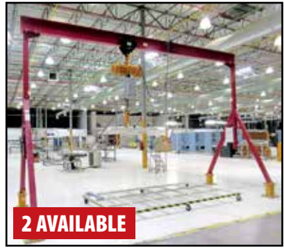
CUSTOM 5 TON STATIONARY GANTRY CRANES