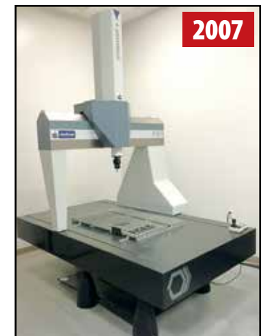
SHEFFIELD ENDEAVOR + 9.12.7 CMM

ALSO: PALLET JACKS, SCISSOR TABLES, HAND TRUCKS, SHOP TRUCKS, ETC.