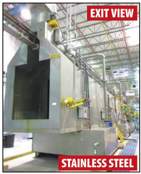
THERMO-TRON-X 8-STAGE PRE-TREATMENT WASHER