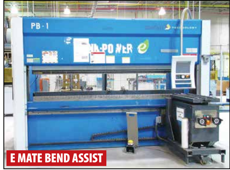
2008 FINN-POWER 100-3100TS1 CNC SERVO-ELECTRIC PRESS BRAKE