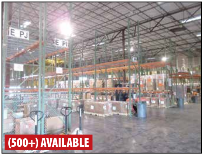
VIEW OF ADJUSTABLE PALLET RACKS