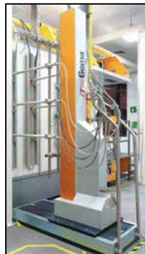
ENVIRONMENTAL AND MASKING ROOM