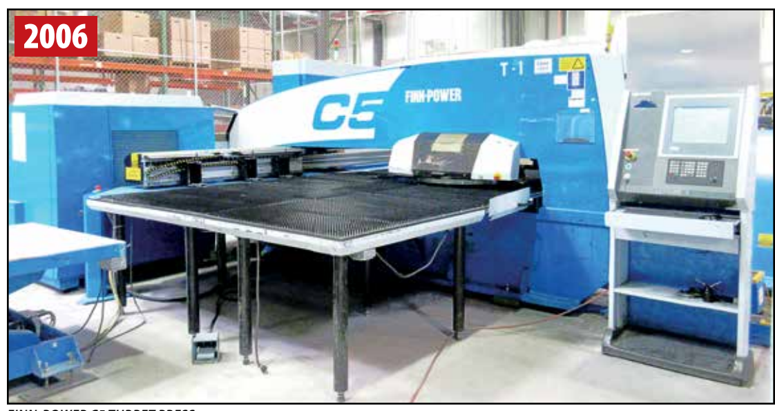
FINN-POWER C5 TURRET PRESS

Av Manuel Talamas Camandari #2451, Parque Industrial Verde Independencia II, Cd., Juarez, Chih, 32580 Mexico The inspection for assets located in all days of this sale will be held on Tuesday, April 26th from 9:00 AM to 4:30 PM MDT