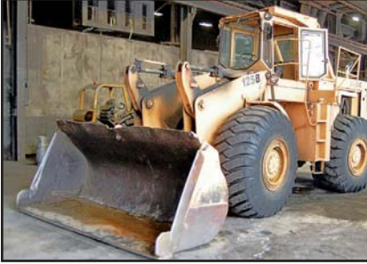
Clark/Michigan 125B Wheel Loader