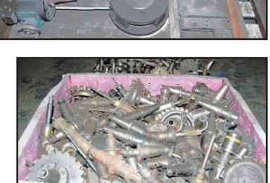
Partial View of Miscellaneous Plant and Shop Support

PLANT SUPPORT, INCL.: Assorted Stainless Steel Tubing, Hydraulic Tubing, Air Hose Reels, Assorted Hydraulic Pump Motors, Electrical Fittings and Conduit Fittings, (20) Antique Rolling Platform Carts, Tooling Carts, Large Quantity Of Lifting Chains and Hooks, Hold Down Sets, Boring Mill Chuck Jaws, Set-Up Blocks, Angle Plates, Pedestal Fans, C-Clamps, Sockets, Wrenches, Hand Tools, Carousel Parts Bins, Pneumatic Grinders, Flex-Arm Pneumatic Torque Gun, (3) Transformers, Cabinets, Drills, Taps, Live Centers, Power Pressure, Washers, Power Tools, Several Sea Storage Containers, Bar Clamps, Bottle Jacks, Scale in Foundry Area, Ladders, Large Quantity of Grinding Wheels, Paint Shaker, Timken Roller Chain, (6) Plastic Liquid Portable Containers, Quantity of Hydraulic Valves, Hydraulic Fittings, Small Parts Washer, Etc.