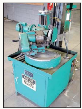
Rush 250 Drill Point Grinder

Assorted Double-Sided and Single-Sided Cantilever Racking (outside)