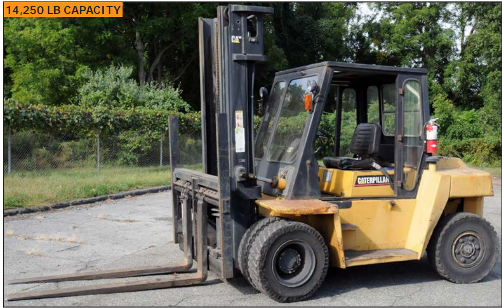
CATERPILLAR DP70 outdoor diesel forklift with cab enclosure