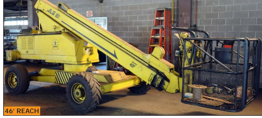
JLG 40FR straight boom lift

This brochure is only a partial listing. PLEASE VISIT OUR WEBSITE