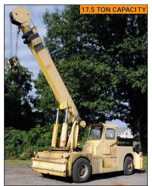
GROVE INDUSTRIAL 1012 mobile crane