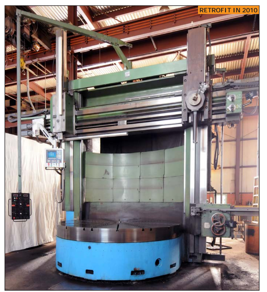
SUMMIT 120" CNC vertical boring mill