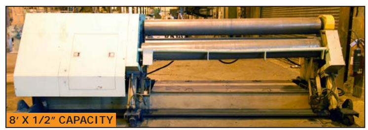
BERTSCH initial type hydraulic pinch bending rolls