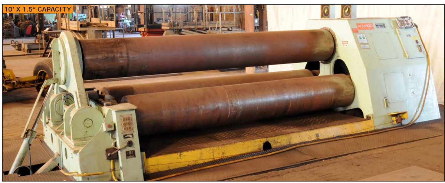
ROUNDO PS 460/10 hydraulic double pinch plate bending rolls