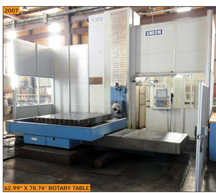
UNION T-130, 5.12" CNC table type horizontal boring mill

View of 138" x 69" x 14" T-slot floor plates