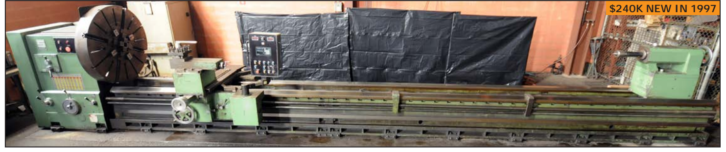
SUMMIT 50-6X320 DC gap bed engine lathe