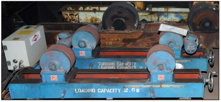
Partial view of tank turning rolls available