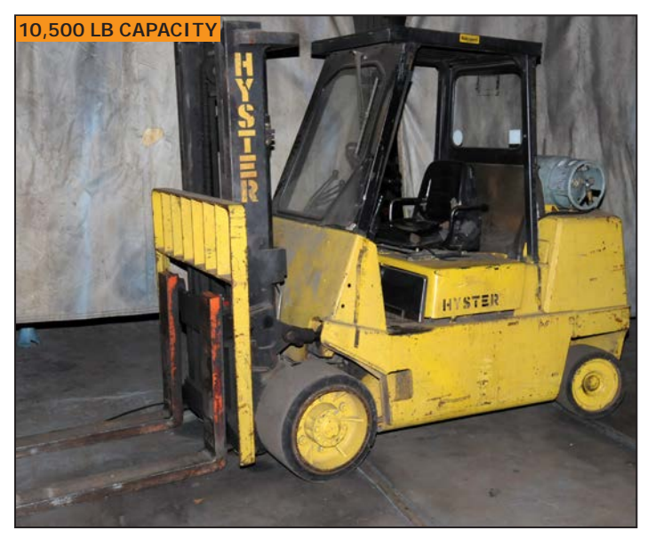
HYSTER S100XL LPG forklift with cab enclosure