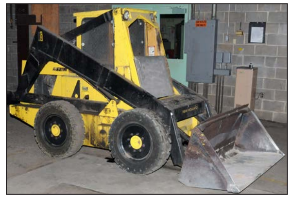
NEW HOLLAND L783 skid steer loader

Partial view of STRATO-LIFT scissor lifts available