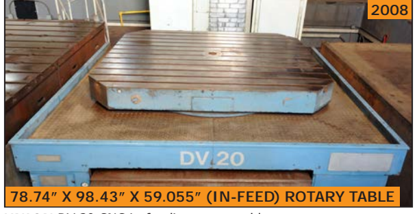
UNION DV 20 CNC in-feeding rotary table