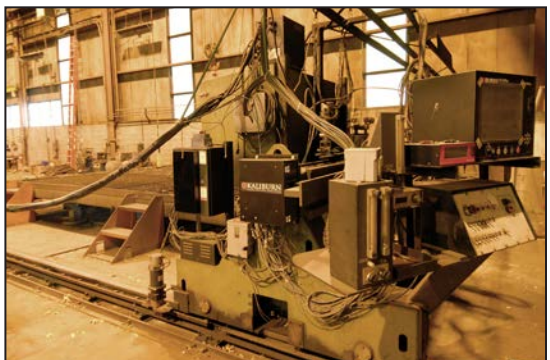
MG CUTTING SYSTEMS CNC plasma & oxy-acetylene cutting table

SMT PULLMAX URSVIKEN KPD 450 hydraulic brake press