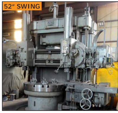
KING vertical boring mill