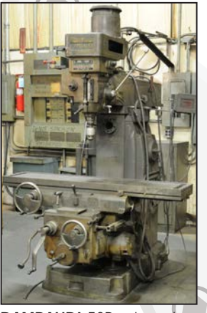
RAMBAUDI FCR universal turret milling machine