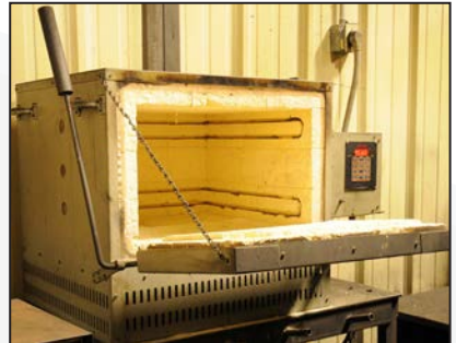
PARAGON HT22D pre heat electric furnace GORBEL freestanding jib crane