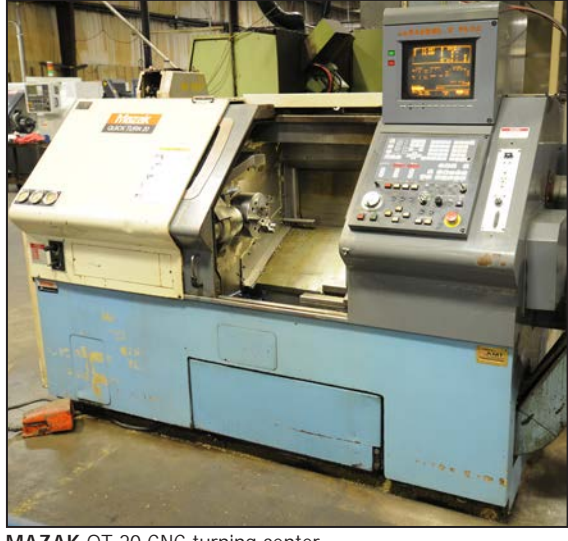
MAZAK QT 20 CNC turning center