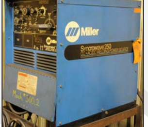
MILLER SYNCHROWAVE 250 TIG welder