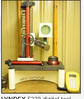
LYNDEX E238 digital tool setter