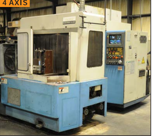
MAZAK H-400/40 twin pallet CNC horizontal machining center