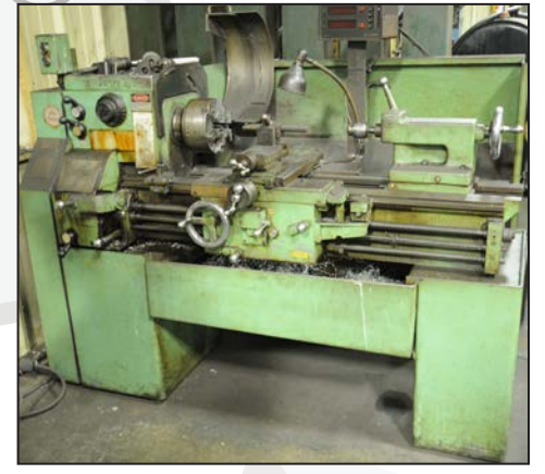
LEBLOND REGAL 1532 engine lathe