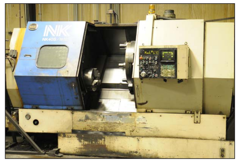
HITACHI SEIKI NK40S CNC turning center