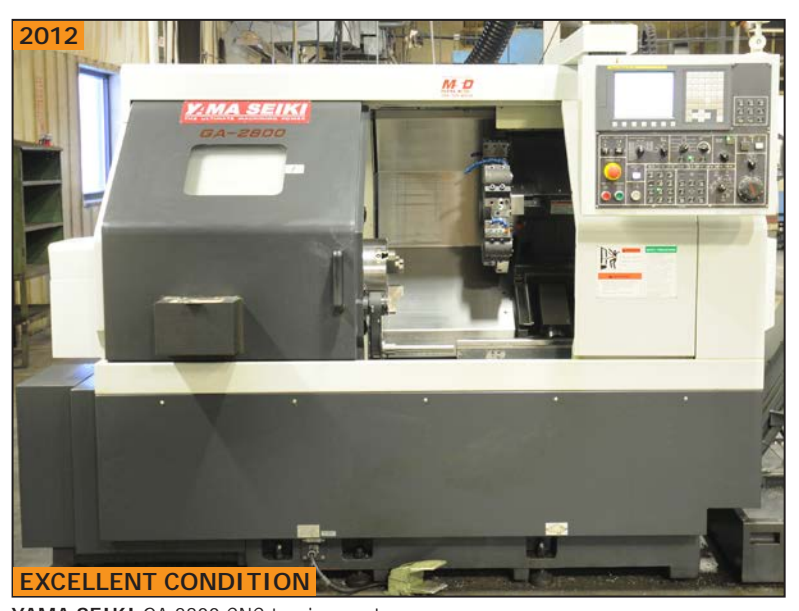
YAMA SEIKI GA-2800 CNC turning center