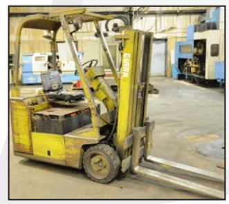
CLARK TWS30B electric forklift