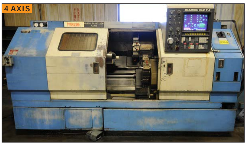
MAZAK QT 20N twin turret CNC turning center