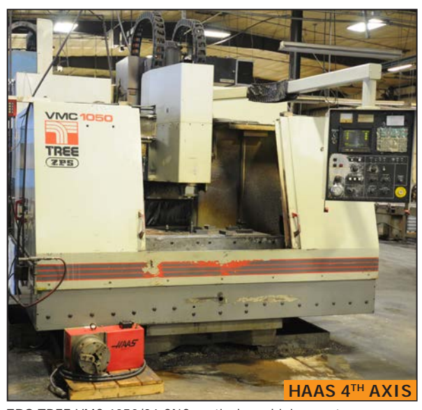
ZPS TREE VMC 1050/24 CNC vertical machining center