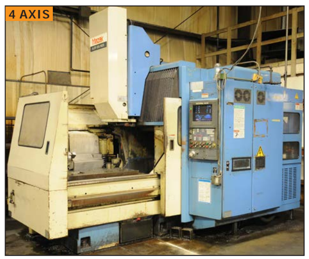
MAZAK AJV-25/405 bridge type CNC vertical machining center