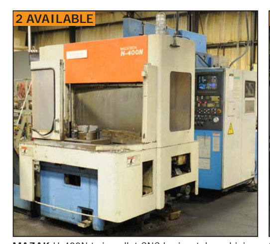
MAZAK H-400N twin pallet CNC horizontal machining center