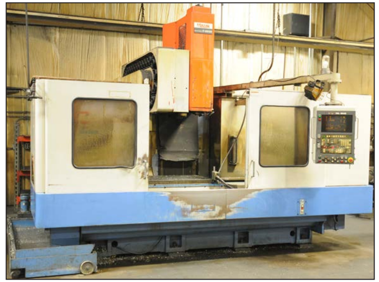
MAZAK V-655B CNC vertical machining center