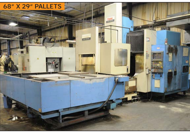
MAZAK AJV-35/60 twin pallet CNC vertical machining center