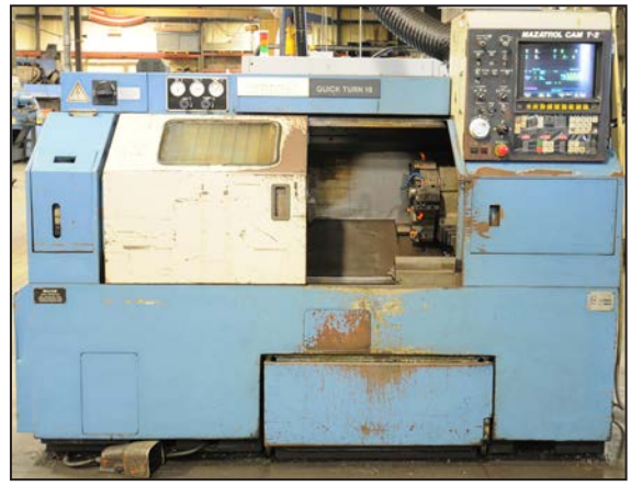
MAZAK QT 15 CNC turning center