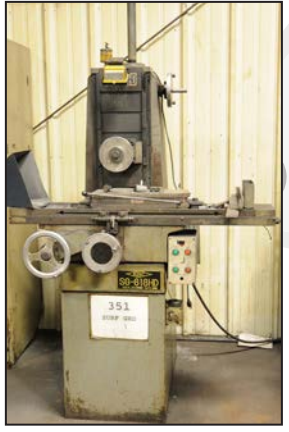
KBC SG-618DH surface grinder