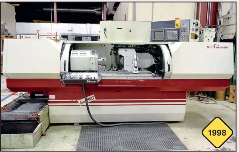
Studer S30 Lean Pro CNC ID/OD Grinder