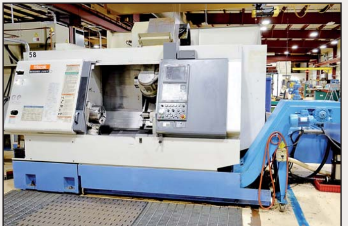
Mazak Integrex 200Y CNC Lathe