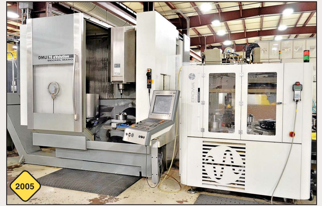
Deckel Maho DMG DMU-70 eVolution CNC Vertical Machining Center, with Erowa Pallet Changer

AUCTION DATE: Tuesday, May 23rd, 2017 at 10:00 a.m. EDT