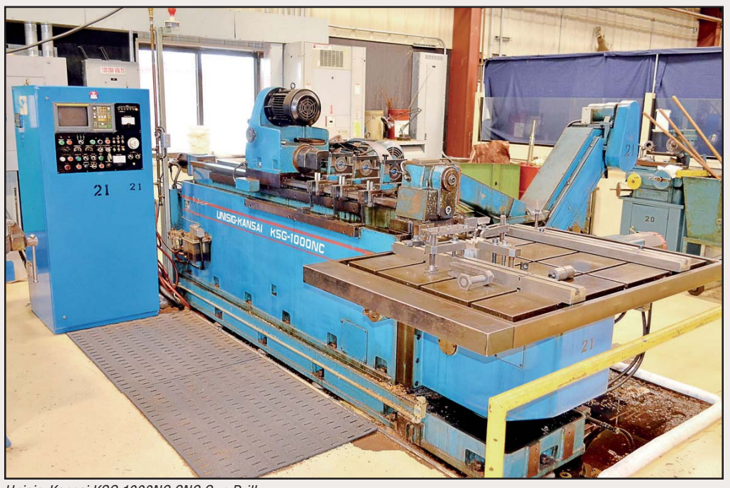
Unisig-Kansai KSG 1000NC CNC Gun Drill