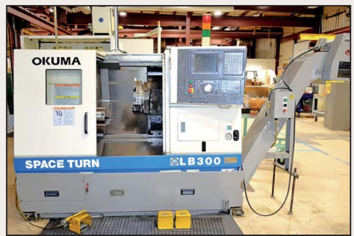
Okuma LB300 Space Turn CNC Lathe

Okuma Captain L370 CNC Lathe , with OSP-P200L CNC controls, 16.54" swing, 14.56" max. turning dia., 20.47" max. turning length, 10" 3-jaw chuck, hydraulic tailstock, 12-position turret, 4,500 max. RPM spindle speeds, 20HP motor, parts catcher, Hennig chip conveyor, S/N: 526295 (2010); with Type RF-5469 high pressure coolant pump, Absolent ODF1000C Dust Collector (2010)