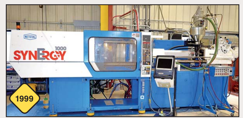
100-Ton Netstal 1000 Synergy Type S-1000-460 CNC Plastic Injection Molder