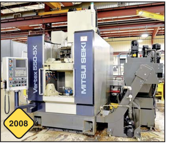
Mitsui Seiki Vertex 550-5X 5-Axis CNC Vertical Machining Center

12 Betnr Industrial Drive Pittsfield, Massachusetts 01201