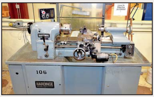
Hardinge HLV-H /TFB Precision Toolroom Turning, Facing and Boring Lathe

Westhoff High-Speed Bench Drill, with 8-1/2" x 8-1/2" working surface table, S/N: 77-683