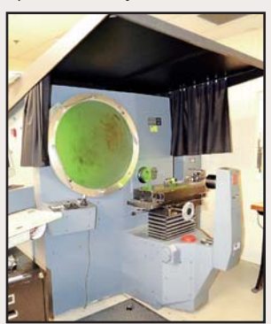
30" Jones & Lamson "Epic 30E' Optical Comparator