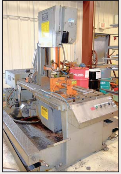
18" Hem V-100LM-2 Vertical Bandsaw

To Register For This Auction, Please Visit www.kosterindustries.com