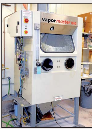
Vapor Master 1010 Reach-In Sand Blast Cabinet