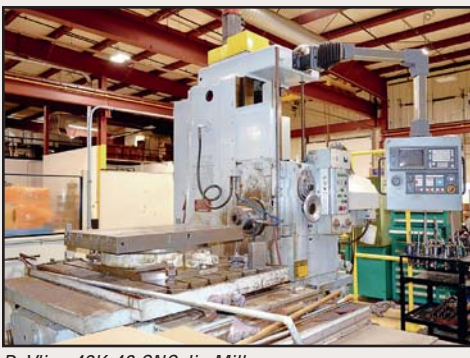
DeVlieg 43K-48 CNC Jig Mill