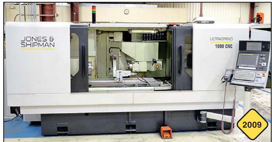
Jones & Shipman 1000 CNC Ultragrind ID/OD Grinder