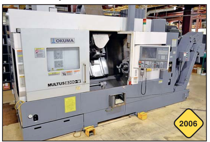
Okuma Multus B300-W Multi-Axis CNC Lathe

Can't attend this auction? Bid online at BidSpotter.com