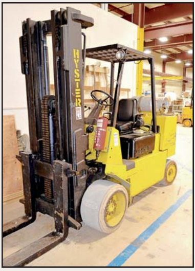
11,750-Lb. Hyster S120XL2S Propane Forklift Truck

FORKLIFT TRUCKS 11,750-Lb. Hyster S120XL2S