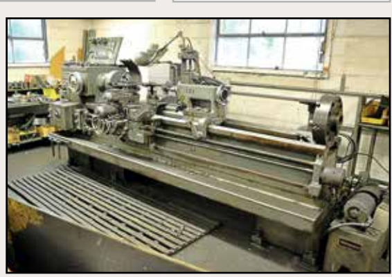
Lodge & Shipley AVS Mdl. 2013 20" x 78" Geared Head Engine Lathe