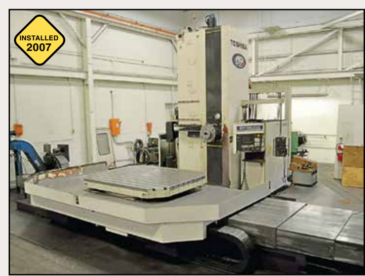
Toshiba Mdl. BP-130.R22 CNC Table-Type Horizontal Boring Mill