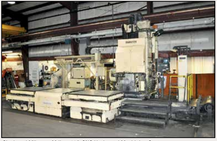
Cincinnati Milacron Mdl. 25HC CNC Horizontal Machining Center