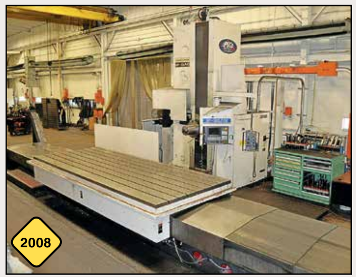
Toshiba Mdl. BP-150.P45 CNC Table-Type Horizontal Boring Mill