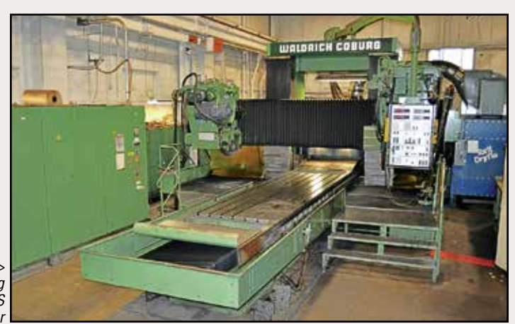
Waldrich-Coburg Mdl. 30-10-S Way Grinder

Waldrich-Coburg Mdl. 30-10-S Way Grinder, with 150" x 177" table size, 68.8" between columns, 177" max. grinder length, 58" max. grinding width, 51.8" max. grinding height, LH vertical grinding wheel, RH horizontal grinding wheel, Torit Downflo collector, S/N: 2.4215-03