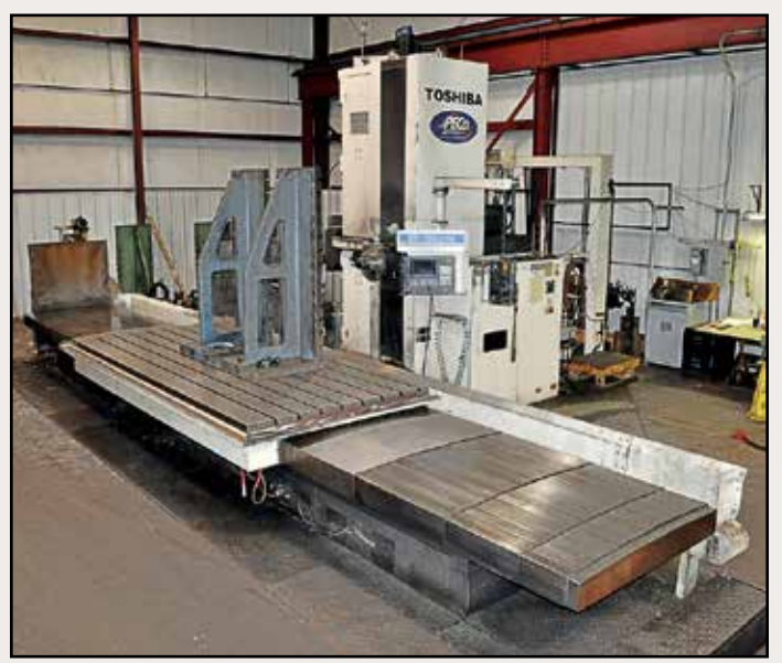
Toshiba Mdl. BP130-P40 CNC Table-Type Horizontal Boring Mill