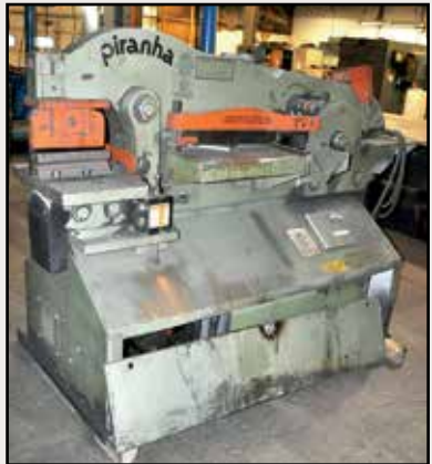
Piranha Mdl. P90 Ironworker