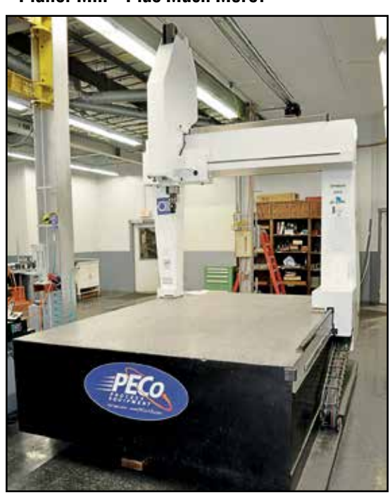
DEA Epsilon 2304 3-Axis Coordinate Measuring Machine

To Register For This Auction, Please Visit www.kosterindustries.com