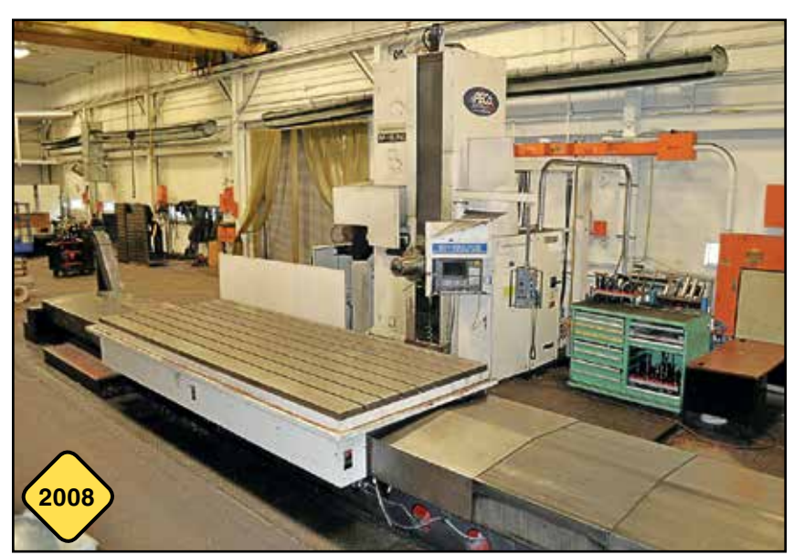
Toshiba Mdl. BP-150.P45 CNC Table-Type Horizontal Boring Mill