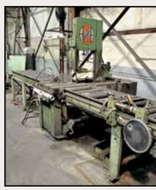
Marvel Series 81 Vertical Bandsaw

DoAll Horizontal Bandsaw , with 12" x 16" capacity, power clamping, infeed conveyor