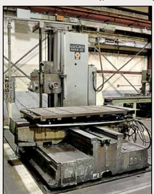
Table-Type Horizontal Boring Mill