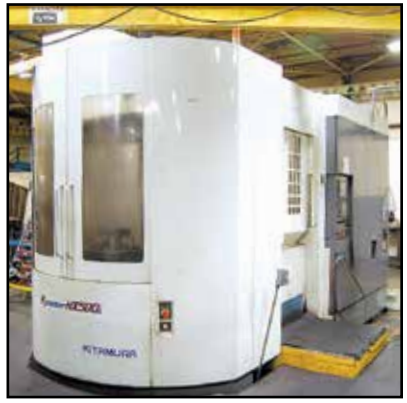
Inder Power Video Available