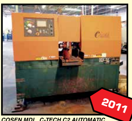
COSEN MDL. C-TECH C2 AUTOMATIC HORIZONTAL BANDSAW