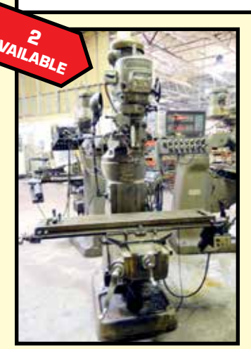
BRIDGEPORT SERIES 1 VERTICAL TURRET MILLING MACHINE

CHINESE MFG. 14" X 40", Go-Fer III variable spd. carriage, Metco Type 5P combustion metallizing gun w/powder hopper, pre-heat torch, gauges.