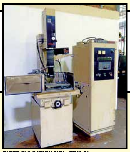
ELTEE PULSATION MDL. TRM-21 EDM MACHINE

INSPECTION: Monday, October 19 9:00 A.M. to 4:00 P.M. & Morning of Sale