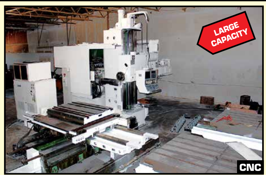
GIDDINGS & LEWIS 6" CNC HORIZONTAL BORING MILL

See Machine Demonstrations Online & at Inspection. Don't Miss This Sale!