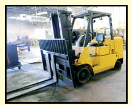
CATERPILLAR 10,000-LB. FORKLIFT

See Machine Demonstrations Online & at Inspection. Don't Miss This Sale!