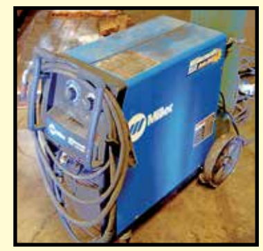
MILLER MILLERMATIC AUTOSET INTEGRATED MIG WELDER