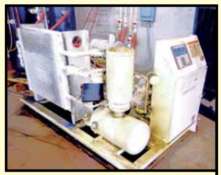
GARDNER DENVER 50 HP ROTARY SCREW AIR COMPRESSOR