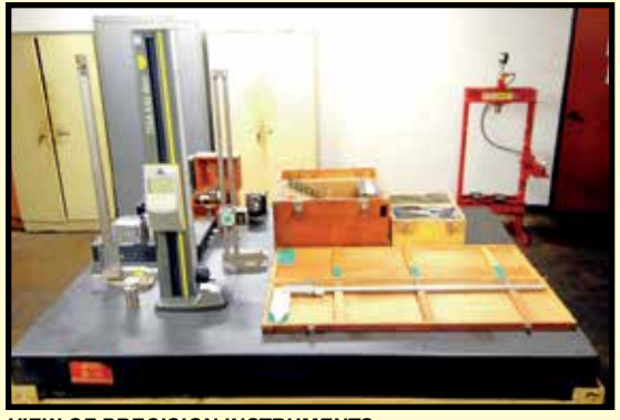
VIEW OF PRECISION INSTRUMENTS