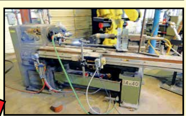
CHINESE MFG. 14" X 40" METALLIZING ENGINE LATHE