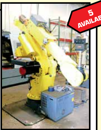
FANUC S-420iF 6-AXIS ROBOTS

(4) FANUC S-420iW, 341-lb. payload, 112.2" high reach, end effector, S/N E98606447, S/N E99-903369. S/N E99304714 S/N E98506942.