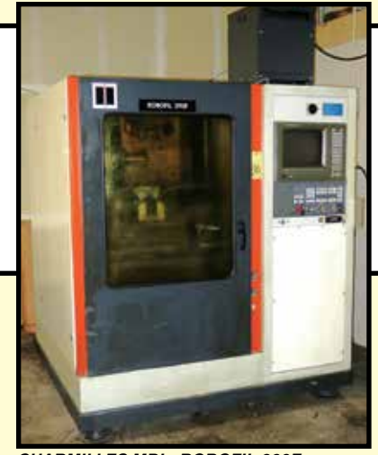
CHARMILLES MDL. ROBOFIL 290F WIRE EDM MACHINE