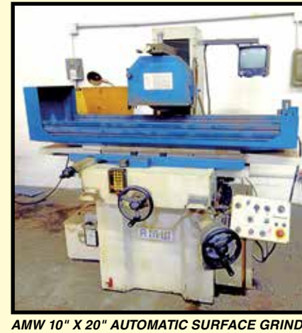
AMW 10" X 20" AUTOMATIC SURFACE GRINDER