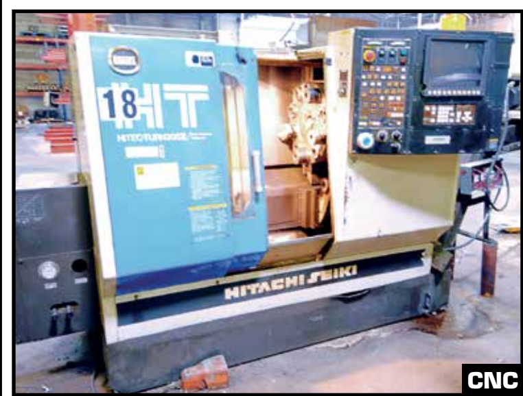
SAMPLE VIEW OF HITACHI SEIKI LATHES AND CELLS

THESE LATHES AND ROBOTS ARE CURRENTLY CONFIGURED IN MANUFACTURING CELLS AND WILL BE OFFERED INDIVIDUALLY AND AS COMPLETE CELLS.