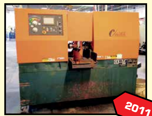
COSEN MDL. C-TECH C2 AUTOMATIC HORIZONTAL BANDSAW