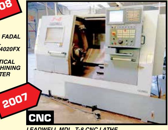
LEADWELL MDL. T-8 CNC LATHE