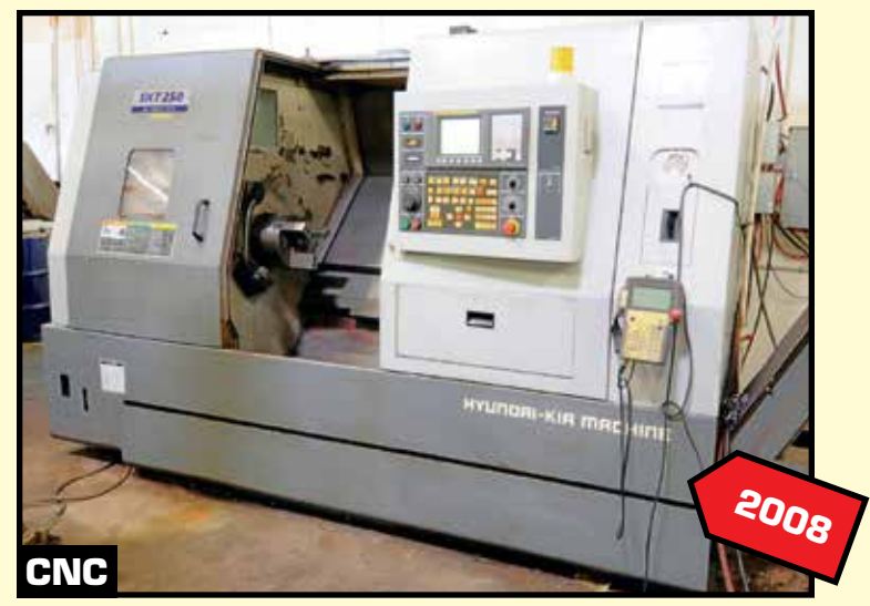
HYUNDAI KIA MDL. SKT-250 CNC LATHE